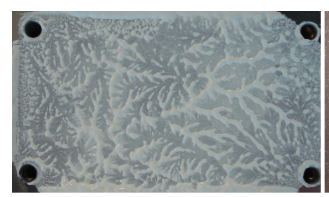
Picture2: Grease on the heat sink after removing the module

The quantity of thermal grease is correct when a small amount of grease appears around the power module once it is bolted down onto the heat sink with the appropriate mounting torque. In any case, the module bottom surface must be completely wetted with thermal grease. (See pictures 2 & 3).