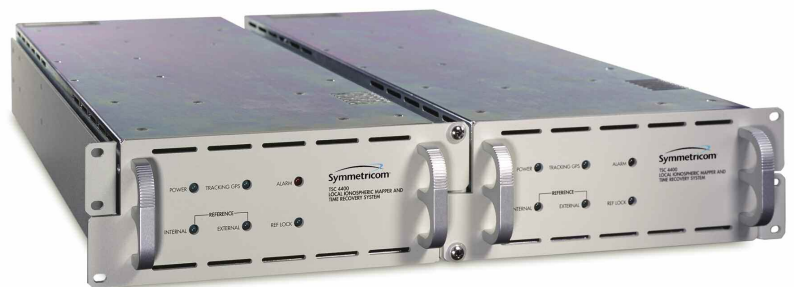
TSC 4400 GPS Disciplined Rb Oscillator

Please contact Symmetricom with any specific requirements.