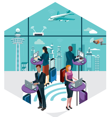
Indoor Wi-Fi network and IP video surveillance