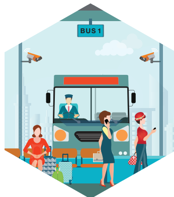
IP video surveillance for outdoor locations