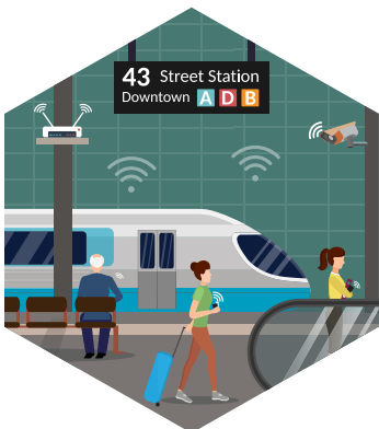
WLAN APs installed in harsh environments