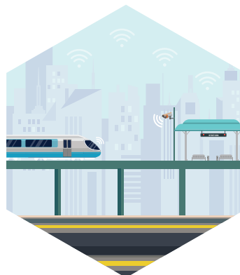
Long distance installations for outdoor IP cameras