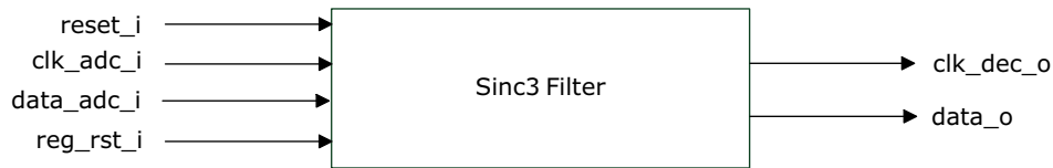
Figure 1 • Block Diagram of Sinc3 Filter

The following figure shows the hardware implementation of Sinc3 filter.