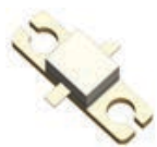
1416GN-120E 0.160" x 0.550" 55-QQ

Microsemi offers a complete family of continuous wave (CW) and pulsed RF and Microwave Silicon Bipolar Junction transistor and GaN-on-SiC HEMT transistor products up to 1400 W to provide system design solutions for HF, VHF, UHF, and L/S/C-band primary and secondary radar, communications, Industrial-Scientific-Medical (ISM), and Space applications.