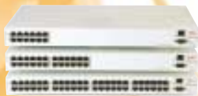
PowerDsine 6000 Family Power over Ethernet Midspan