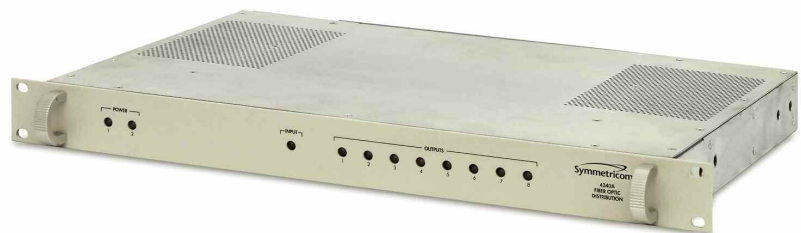
TSC 4340A Fiberoptic Distribution Amplifier

For example, a Fiberoptic Distribution Amplifier with one input transceiver and 8 output transceivers can multiply one UTC output to 8. In this scenario, the customer can add 32 fiberoptic outputs to the system by adding four expansion chassis. By adding one more distribution level, the number of fiberoptic outputs and potential TCTs in the system can increase to at least 256. And upgrading is as easy as adding hardware. No configuration is necessary. Hot swap SFP sockets for fiber optic transceivers provides easy expansion or transceiver replacement for different networks. An AC or DC hot swap redundant supply can be ordered with the unit.