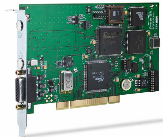
bc635PCI-U Time & Frequency Processor

A key feature of the bc635PCI-U is the ability to generate interrupts on the PCI bus at programmable rates. These interrupts can be used to synchronize applications on the host computer as well as signal specific events. The external frequency input is a unique feature allowing the internal timing of the bc635PCI-U to slave to the 10 MHz output from a Cesium or Rubidium standard. This creates an extremely stable PCI based clock for all bc635PCI-U timing functions and is superior to any disciplining technique.