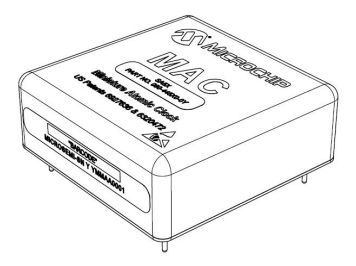
Figure 2: Microchip Rubidium based Miniature Atomic Clock used in Stratum 1 SyncServers for extended holdover can fit in the palm of your hand.

For reliability, these NTP servers also employ stable internal oscillators in case the server loses the satellite signal and goes into holdover. Oscillator holdover accuracy varies based on the type of oscillator: from 400 microseconds over the first 24 hours of signal loss for a standard quartz oscillator to less than 1 microsecond for an inexpensive rubidium atomic oscillator.