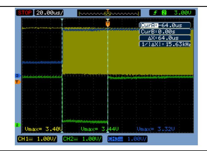
Figure 2 • Pulse Generated Due to Reset from the POR or PPR Circuit

The reset pulse ( RST_n ) duration can be increased by placing a counter. Figure 2 shows a pulse generated for the duration of 64 us using a counter that starts counting from a known state set by the reset generated from the POR/PPR circuit. The generated pulse can be used as reset pulse for the rest of the logic in the fabric. Refer to "Appendix A - Design Files" on page 5 for more information on the design used for the POR/PPR circuit validation. The value of the external weak pull-up resistor must be in the range of 10 K \Omega to 100 K \Omega depending on the noise on the board. There is some static current flowing from VCCI after POR/PPR occurred and it is equal to VCCI/R<sub>Pull-up</sub>.