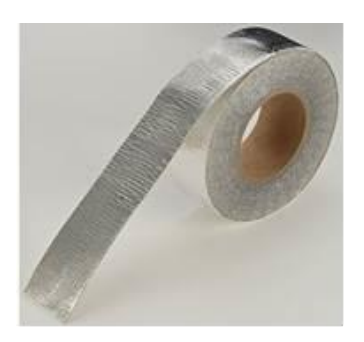
Figure 2. Example of heat shield tape

Use a heat shield to protect the device's top lid cover from excess heat during the de-soldering process. A typical heat shield has radiant heat reflected material on one side and adhesive on the other side. Heat shield materials come in many forms and sizes. Select a heat shield that has a minimum rating of 500°C. Figure 2 shows an example of a heat shield tape. A search on the internet will help you discover heat shield suppliers.