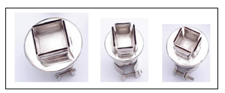
Figure 3. Examples of hot air nozzle tips

2) Next, select a hot air nozzle tip to match the QFN SMT device's package dimension size. Select a nozzle that will direct the hot air to the soldering pins of the device package and not onto the top lid surface of the device package. This nozzle will be used with the top heating source. Figure 3 shows examples of different sizes of hot air nozzle tips.