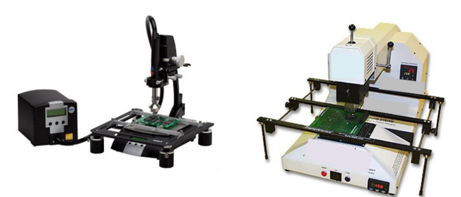
Figure 5. Examples of PCB rework stations (heating available from the top and bottom)

Do not exceed 250°C on the QFN SMT device and no more than about 30 to 60 seconds at the peak temperature.