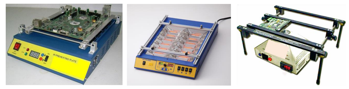
Figure 4. Examples of PCB rework stations with preheater from the bottom